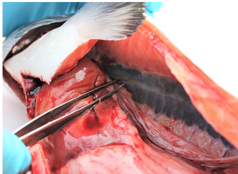
Kidney (head kidney, front part)