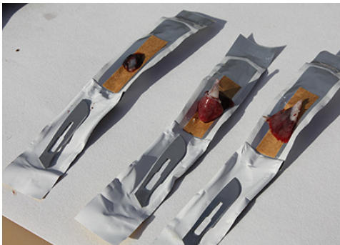
Trimming of the tissue on the scalpel package