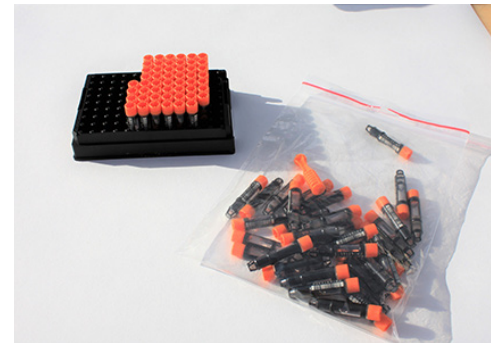
Submission of test tubes in a plastic bag